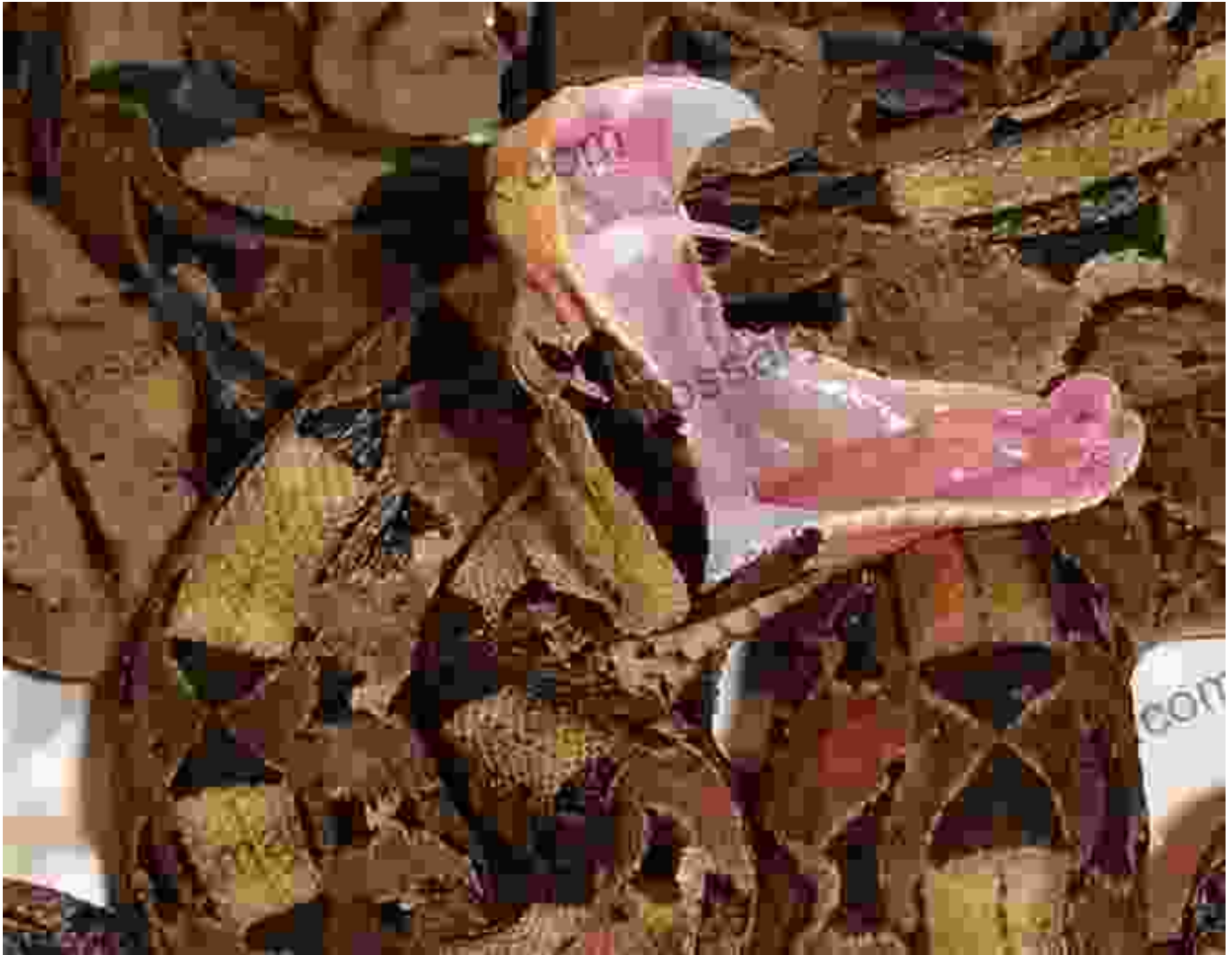
A cat viper with its fangs extended.