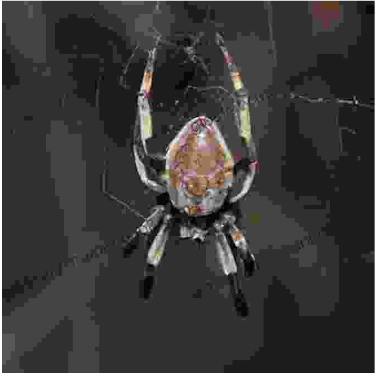
Figure 2: So Spider So What 57, an active hunter with remarkable speed and agility.