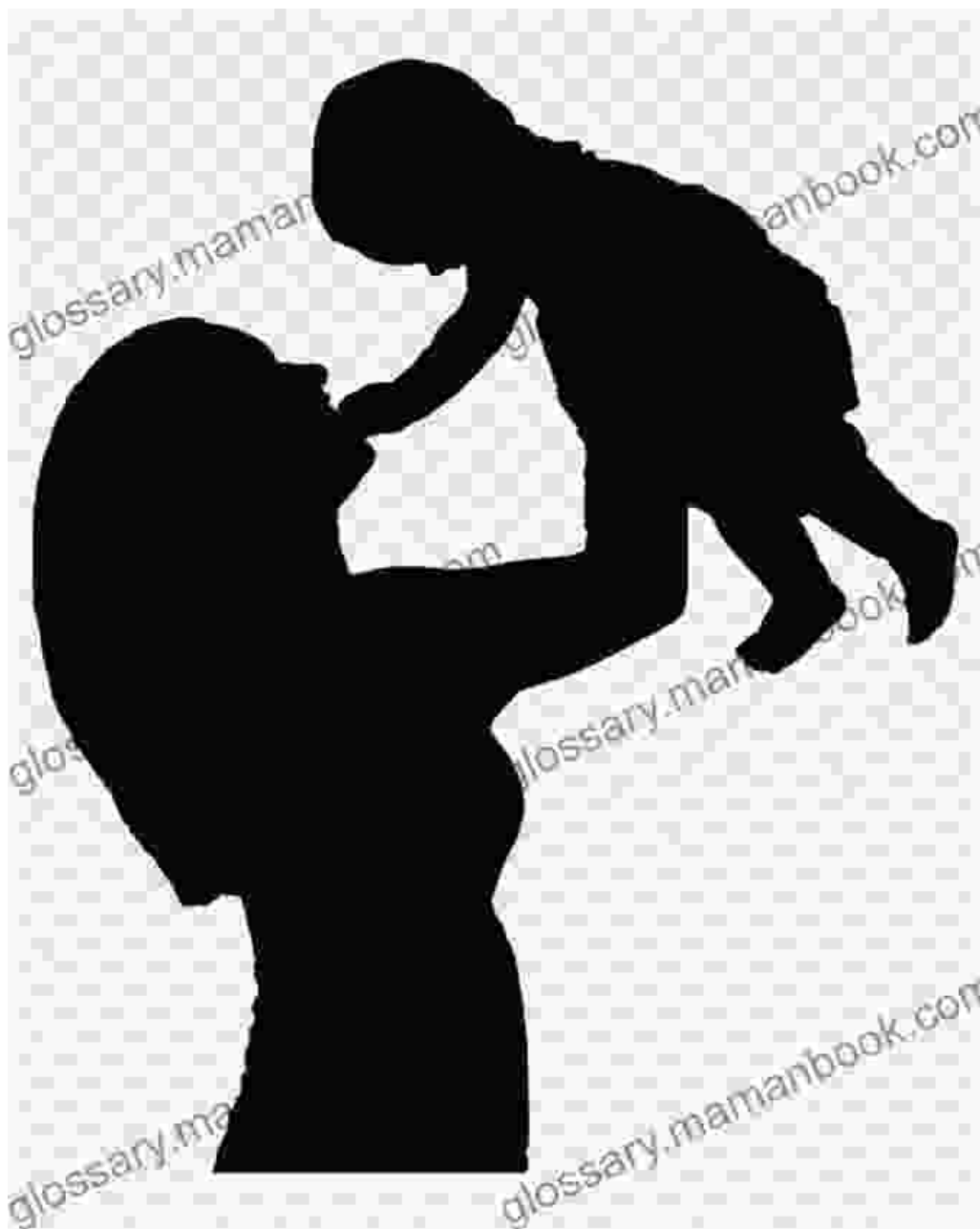
"The Mother" by Edna Alexander, a poignant depiction of maternal love and resilience